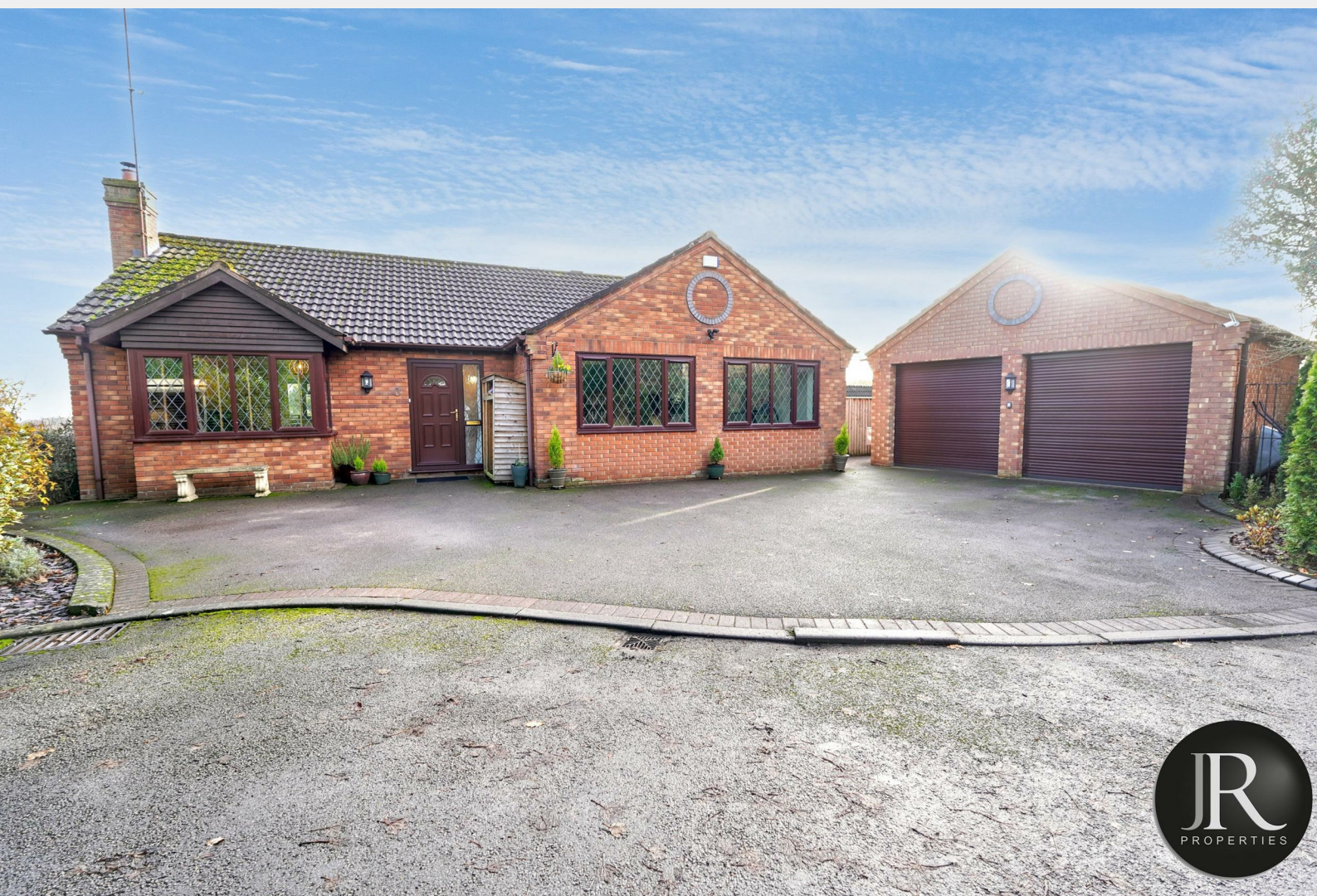
3 Horns Croft, Slitting Mill, WS15 2YQ Offers In The Region Of £599,995